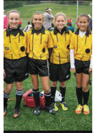
New referees are always in demand!