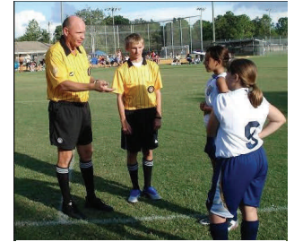
Experienced referees are paired with a new referee. They provide guidance, advice and critical